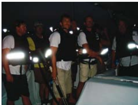
Ready for action

In our time in the Mediterranean we have visited most countries from Istanbul, Turkey in the NE, to the French Côte d’Azur in the West. We have put some 18,000 nautical miles “on the clock” so far, and Red Dragon has acquitted herself very well indeed. Additionally, she draws many admirers wherever she goes, and in terms of her sailing characteristics - she has seen off a few other yachts with a clean pair of heels, leaving them in her wake at the same