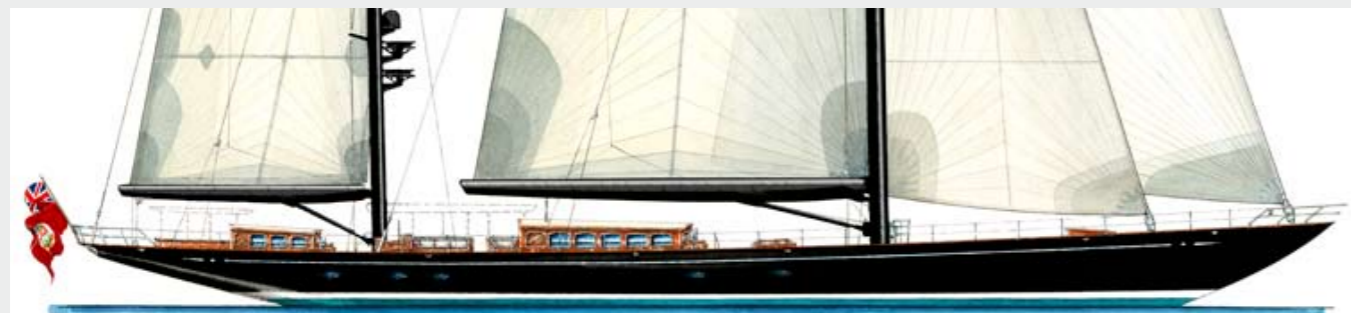
MCM #151 : Delivery 2010 Designer Hoek Design Builder Vitters LOA 55.0m LWL 38.4m Beam 9.5m Draft 4.8m