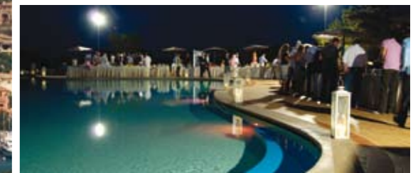
Boat International Silver Jubilee 2008, Porto Cervo