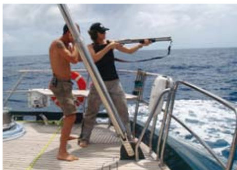
Chief Stewardess prepares for Somali coast

time as putting broad smiles on the faces of her crew - she is an absolute joy to sail. Top speed achieved so far is 18.3 knots.