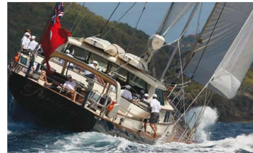
Paraiso, St Barths Bucket 2008