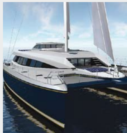
Q5 : Delivery 2009