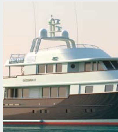
CII : Delivery 2010