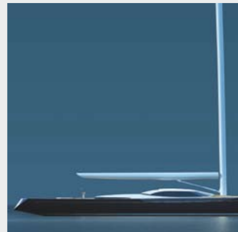
Lady B : Delivery 2009