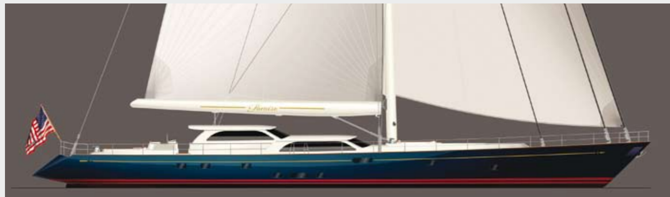
Paraiso 44 : Delivery 2011 Designer Fontaine Design Group Builder Alloy Yachts LOA 44.96m LWL 37.06m Beam 9.67m Draft 4.42m