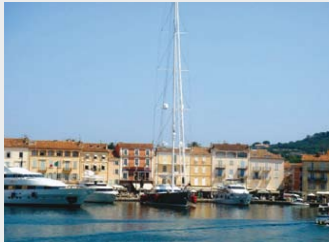
Red Dragon at St Tropez

With the global economic turbulence, fuel prices fluctuating, increasing awareness of environmental issues as they pertain to Superyachting, tightening offshore financial controls, increasing security requirements, we in the Yacht Management group have had to be on top of every change or influence that effects how our clients operate and enjoy their yachts.