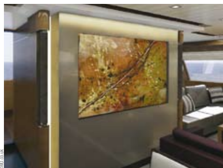
Along with Dubois and Redman Whiteley Dixon, the team thought outside the box for the new Kokomo 's 130 tonne hydraulic lifting keel box: an artwork drops down to reveal a 55 inch television

The group has recently won three awards and more could be in the offing with several MCM-managed launches scheduled for the next two years. These include the 58 metre Dubois and Redman Whiteley Dixon-designed Kokomo , the 34 metre Reichel Pugh-designed Nauta 112 , the 45 metre Paraiso from Fontaine Design, the 27 metre Atalante from Hoek Design, the 30 metre Warwick and Redman Whiteley Dixon-designed Q5 , the 44 metre Dubois and Rhoades Young project Lady B and the 42 metre Langan and Rhoades Young yacht CII .