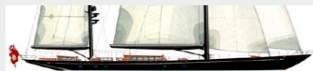
MCM151 : Delivery 2010 Designer Hoek Design Builder Vitters LOA 55.0m LWL 38.4m Beam 9.5m Draft 4.8m