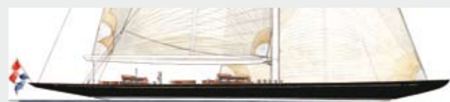
J Boat Lionheart : Delivery 2010 Designer Hoek Design Builder Claasen Jachtbouw LOA 43.4m LWL 26.51m Beam 6.55m Draft 4.8m