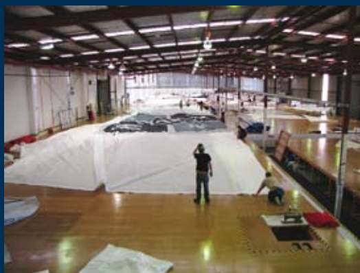
2,500m 2 asymmetrical spinnaker at Doyle Sails