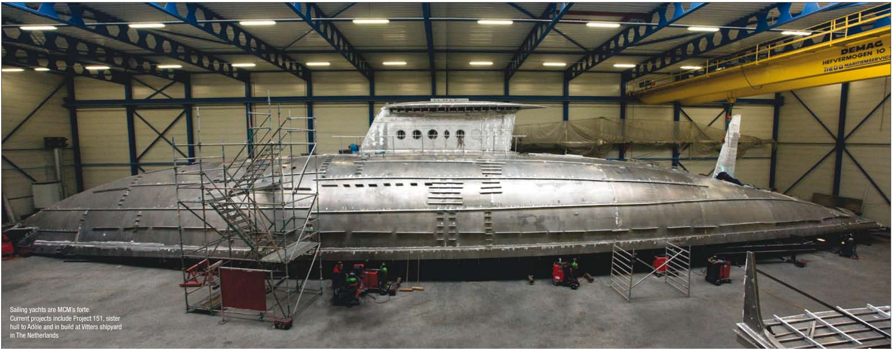
Sailing yachts are MCM's forte. Current projects include Project 151, sister hull to Adèle and in build at Vitters shipyard in The Netherlands