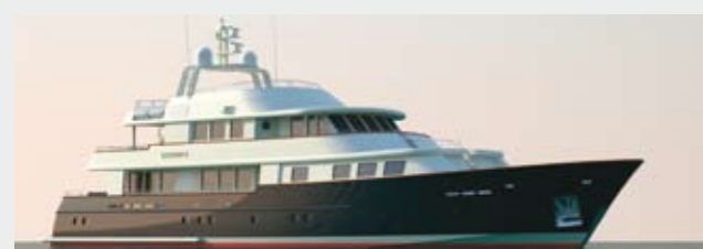
CII : Delivery 2010 Designer Langan Design Associates Builder Holland Jachtbouw LOA 42.28m LWL 38.25m Beam 8.4m Draft 1.9m