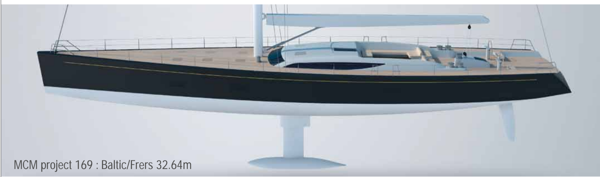
MCM project 169 : Baltic/Frers 32.64m

In addition to the Hoek/Huisman project described on the front page, we are also very pleased to announce two other new projects: