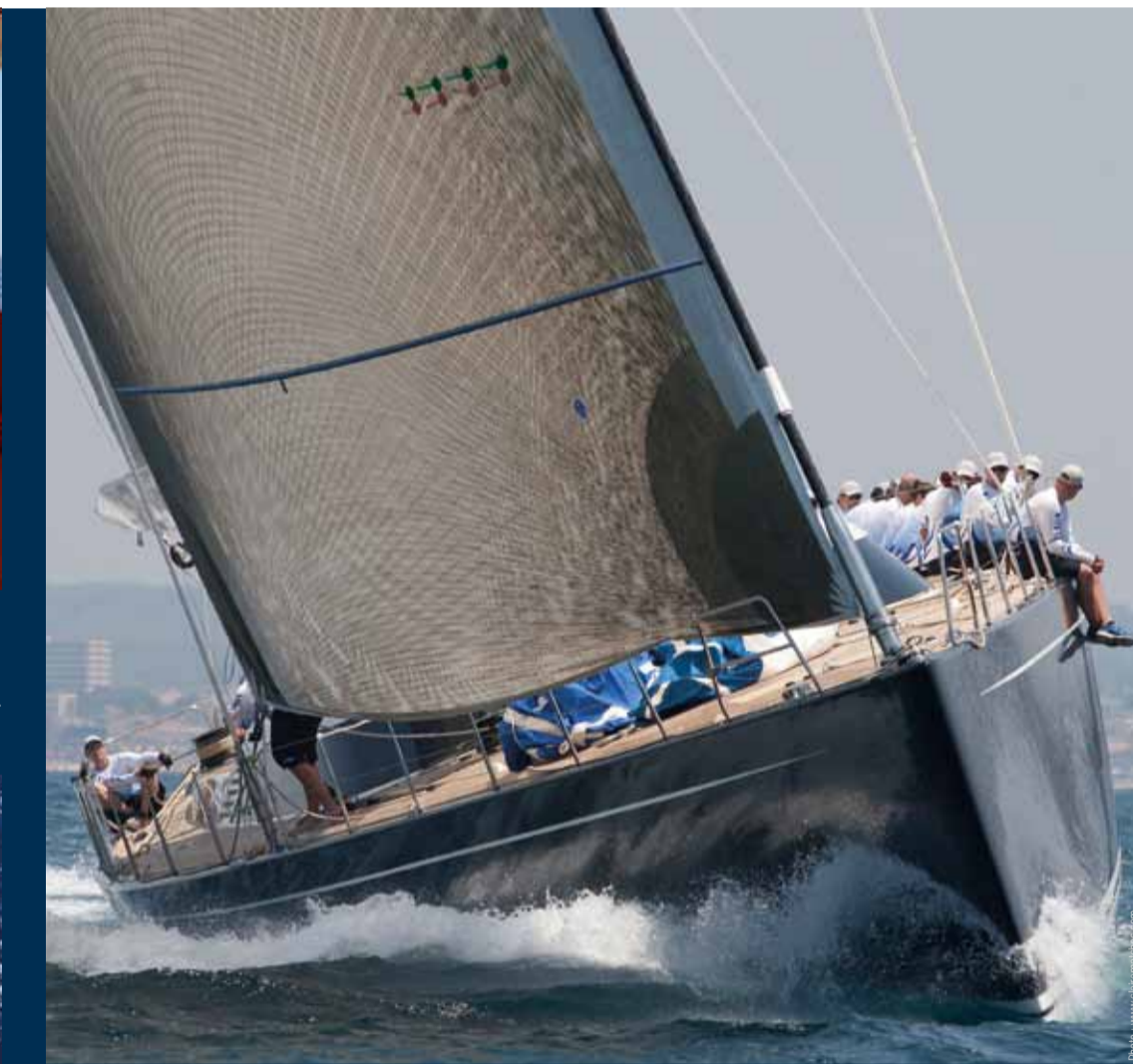
The Nautica/Richel Pugh 34.1m Nilaya also starred at the Palma SYC, winning the performance division; congratulations to Owner and crew on this fine result.