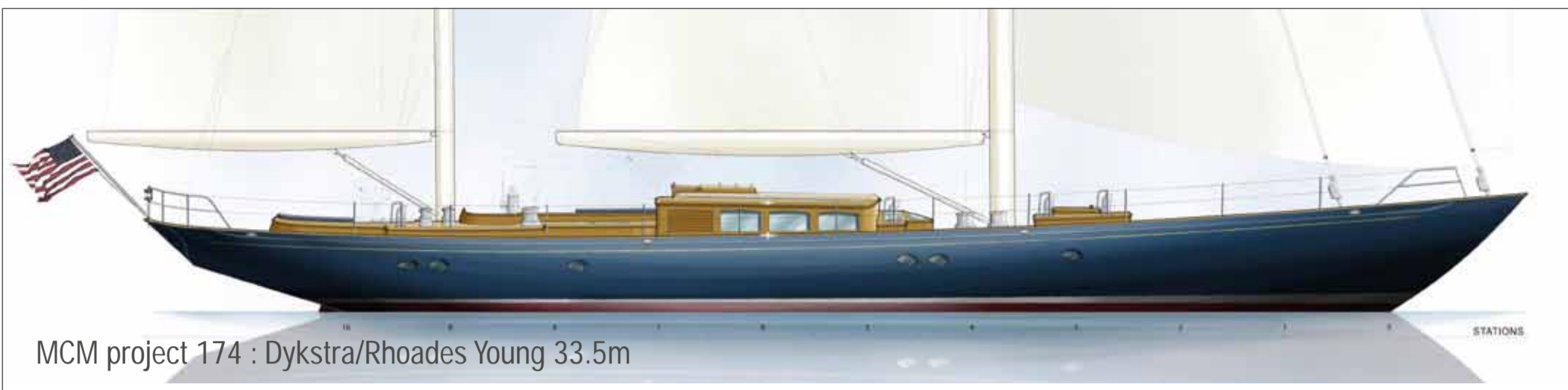
MCM project 174 : Dykstra/Rhoades Young 33.5m