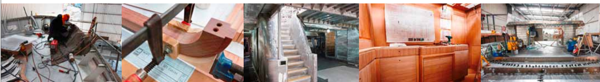
MCM project 155 (above): the handsome Van Der Velden designed 39m steel hull/aluminium superstructure expedition motor yacht is progressing extremely well at Alloy Yachts. The RWD walnut interior is now starting to be varnished and installed. We are looking forward to her launch in November 2012. The Warwick designed 30m catamaran (MCM project 117) currently under construction at Yachting Developments in Auckland is also steaming ahead. On a recent visit to the RWD interior that is being built by SINZ, also in Auckland, the client said "I couldn't be happier - it's everything I hoped it would be". We will be conducting sailing trials in the Hauraki Gulf in April 2012.